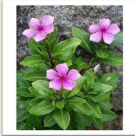
Fig.3:- Vince plant