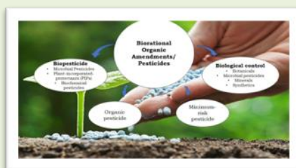
Fig.2:- Biorational organic amendments

Pest and Disease Management: Integrated pest management (IPM) practices and disease control measures are necessary to protect crops from damage. Pests and diseases can affect both plant growth and the quality of medicinal compounds